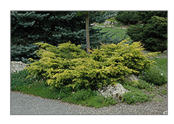
Old Gold Juniper

A stunning color accent landscape evergreen; a compact spreader with arching branches in a striking gold, slightly droopy tips; a superb groundcover or massing plant for color with genuine character when mature