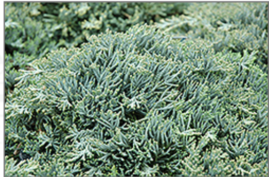
Icee Blue Juniper foliage