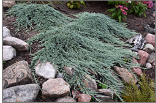
Icee Blue Juniper

Icee Blue Juniper is recommended for the following landscape applications;