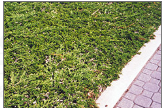
Prince of Wales Juniper