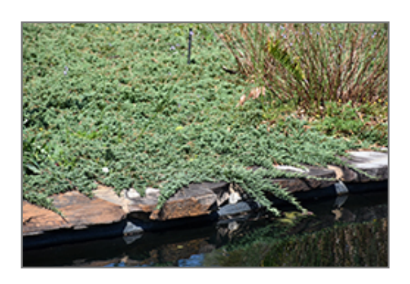
Blue Rug Juniper

Blue Rug Juniper will grow to be about 8 inches tall at maturity, with a spread of 7 feet. It tends to fill out right to the ground and therefore doesn't necessarily require facer plants in front. It grows at a slow rate, and under ideal conditions can be expected to live for approximately 30 years.