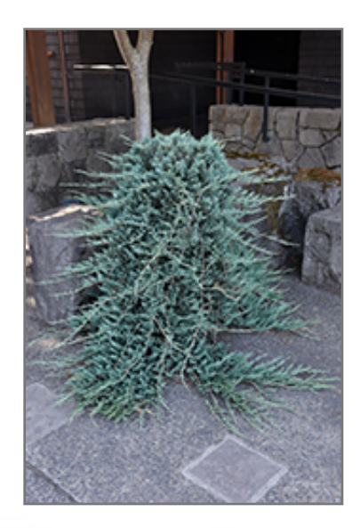
Blue Rug Juniper

This is a relatively low maintenance shrub, and is best pruned in late winter once the threat of extreme cold has passed. Deer don't particularly care for this plant and will usually leave it alone in favor of tastier treats. It has no significant negative characteristics.