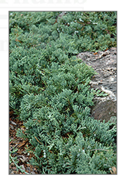
Blue Rug Juniper foliage