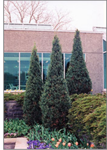
Skyrocket Juniper