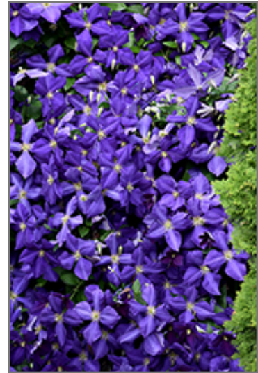
Jackmanii Clematis in bloom

Jackmanii Clematis is recommended for the following landscape applications;