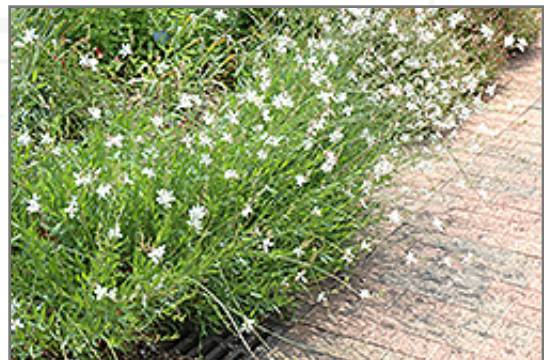
Whirling Butterflies Gaura in bloom