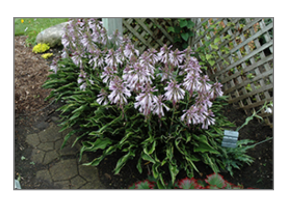
Praying Hands Hosta in bloom