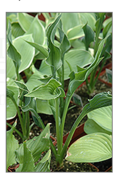
Praying Hands Hosta foliage