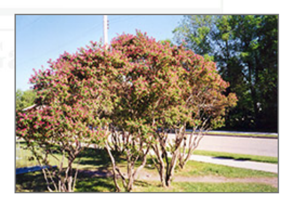
Arnold Red Tatarian Honeysuckle in bloom