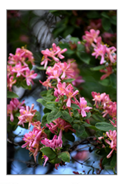
Arnold Red Tatarian Honeysuckle flowers

This shrub will require occasional maintenance and upkeep, and is best pruned in late winter once the threat of extreme cold has passed. It is a good choice for attracting butterflies and hummingbirds to your yard. It has no significant negative characteristics.