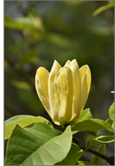
Yellow Bird Magnolia flowers