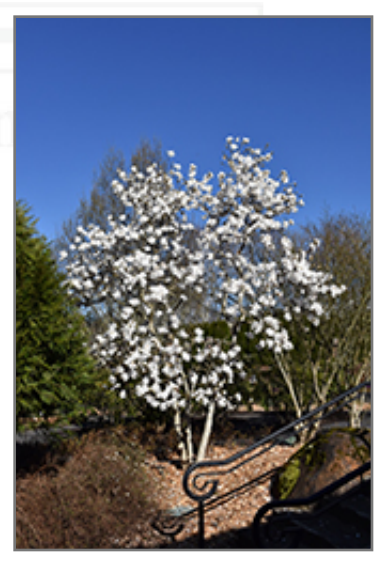
Royal Star Magnolia in bloom Photo courtesy of NetPS Plant Finder