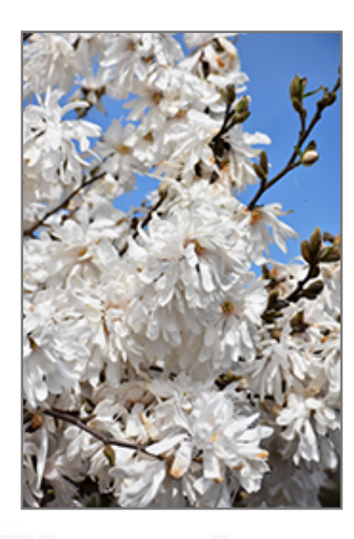
Royal Star Magnolia flowers

Royal Star Magnolia is recommended for the following landscape applications;