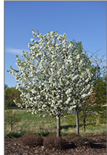
Dolgo Apple in bloom