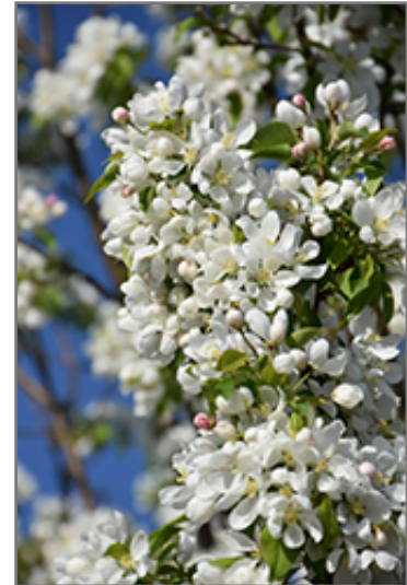
Dolgo Apple flowers

This tree is typically grown in a designated area of the yard because of its mature size and spread. It should only be grown in full sunlight. It prefers to grow in average to moist conditions, and shouldn't be allowed to dry out. It is not particular as to soil type or pH. It is highly tolerant of urban pollution and will even thrive in inner city environments. This particular variety is an interspecific hybrid.