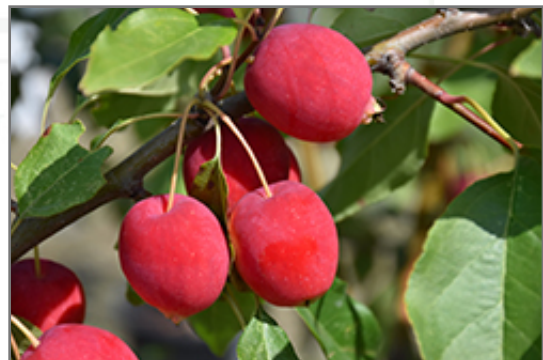
Dolgo Apple fruit