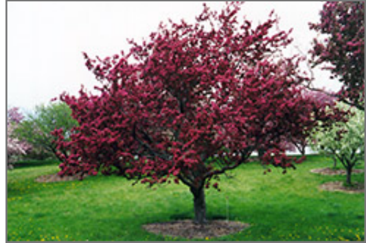
Profusion Flowering Crab in bloom

Profusion Flowering Crab is recommended for the following landscape applications;