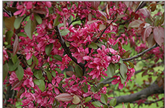
Profusion Flowering Crab flowers