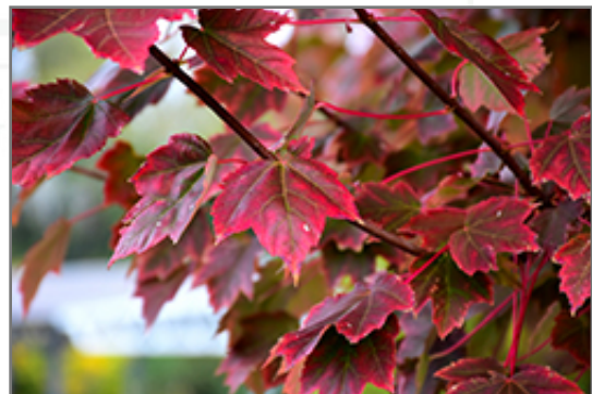
Brandywine Red Maple in fall