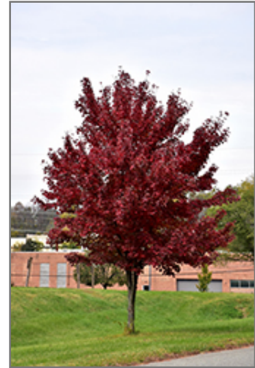
Brandywine Red Maple in fall

Brandywine Red Maple is recommended for the following landscape applications;