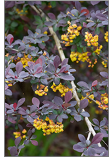
Royal Cloak Japanese Barberry flowers

This shrub should only be grown in full sunlight. It does best in average to evenly moist conditions, but will not tolerate standing water. It is not particular as to soil type or pH. It is highly tolerant of urban pollution and will even thrive in inner city environments. This is a selected variety of a species not originally from North America.