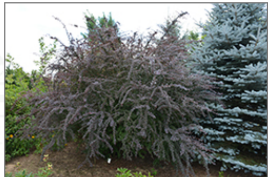
Royal Cloak Japanese Barberry