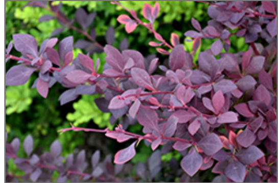
Royal Cloak Japanese Barberry foliage