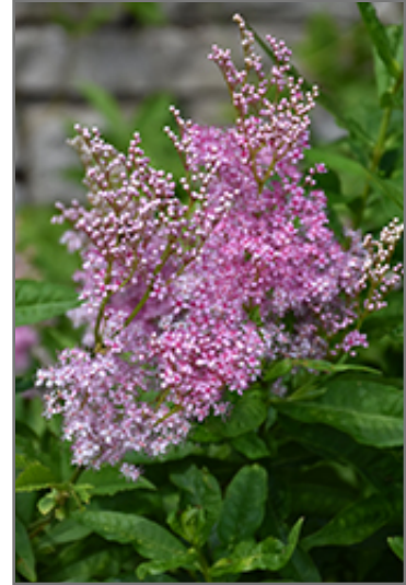
Venusta Queen Of The Prairie flowers

This is a relatively low maintenance plant, and is best cleaned up in early spring before it resumes active growth for the season. Deer don't particularly care for this plant and will usually leave it alone in favor of tastier treats. It has no significant negative characteristics.