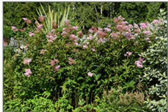
Venusta Queen Of The Prairie in bloom