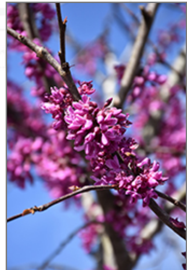
Eastern Redbud (tree form) flowers