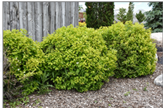
Golden Mockorange