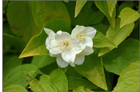
Golden Mockorange flowers

Golden Mockorange is recommended for the following landscape applications;