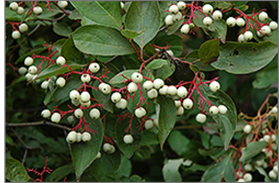
Gray Dogwood fruit

Gray Dogwood is recommended for the following landscape applications;