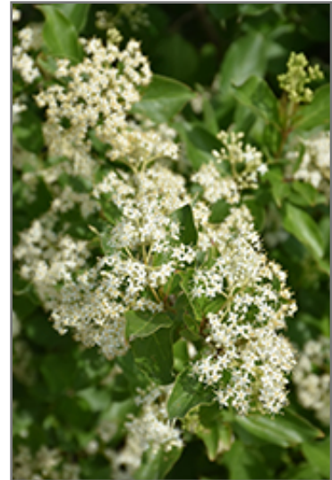
Gray Dogwood flowers

This shrub performs well in both full sun and full shade. It is an amazingly adaptable plant, tolerating both dry conditions and even some standing water. It is not particular as to soil type or pH. It is highly tolerant of urban pollution and will even thrive in inner city environments. Consider applying a thick mulch around the root zone in winter to protect it in exposed locations or colder microclimates. This species is native to parts of North America.