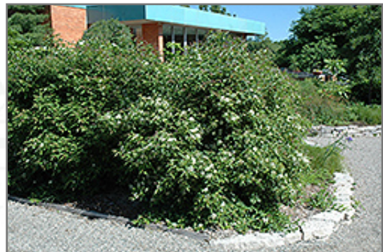
Gray Dogwood in bloom