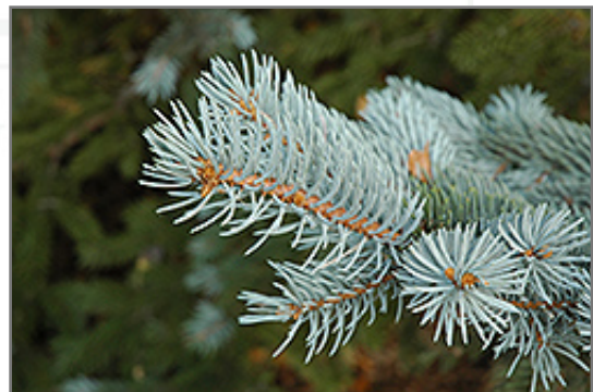
Blue Colorado Spruce foliage