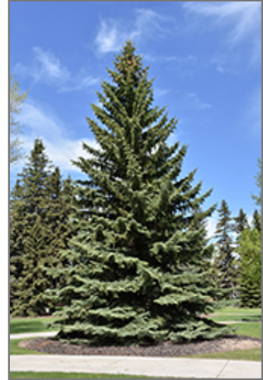
Blue Colorado Spruce

Blue Colorado Spruce is a dense evergreen tree with a strong central leader and a distinctive and refined pyramidal form. Its average texture blends into the landscape, but can be balanced by one or two finer or coarser trees or shrubs for an effective composition.