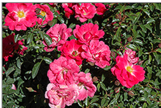
Flower Carpet Pink Supreme Rose flowers