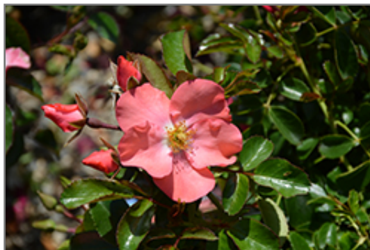
Flower Carpet Pink Supreme Rose flowers

This shrub will require occasional maintenance and upkeep, and is best pruned in late winter once the threat of extreme cold has passed. It is a good choice for attracting bees to your yard. It has no significant negative characteristics.