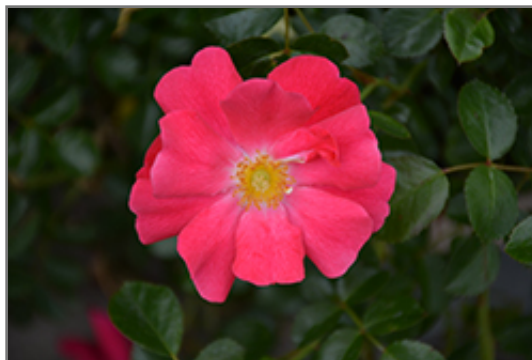
Flower Carpet Pink Supreme Rose flowers

Flower Carpet Pink Supreme Rose will grow to be about 3 feet tall at maturity, with a spread of 3 feet. It tends to fill out right to the ground and therefore doesn't necessarily require facer plants in front. It grows at a fast rate, and under ideal conditions can be expected to live for approximately 30 years.