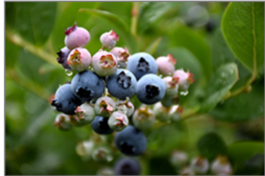
Top Hat Blueberry fruit

Top Hat Blueberry is a multi-stemmed deciduous shrub with an upright spreading habit of growth. Its average texture blends into the landscape, but can be balanced by one or two finer or coarser trees or shrubs for an effective composition.