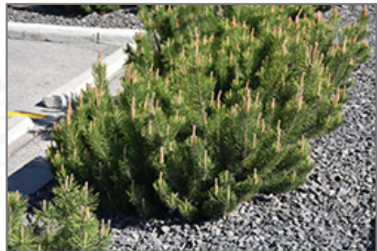
Dwarf Mugo Pine