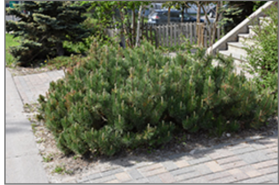
Dwarf Mugo Pine

Dwarf Mugo Pine is recommended for the following landscape applications;