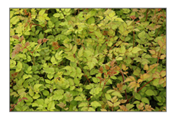
Color Flash Lime Astilbe foliage

Color Flash Lime Astilbe is recommended for the following landscape applications;