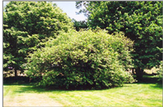
American Hazelnut

This plant is typically grown in a designated edibles garden. It performs well in both full sun and full shade. It is very adaptable to both dry and moist locations, and should do just fine under average home landscape conditions. It is considered to be drought-tolerant, and thus makes an ideal choice for xeriscaping or the moisture-conserving landscape. It is not particular as to soil type or pH. It is highly tolerant of urban pollution and will even thrive in inner city environments. This species is native to parts of North America.