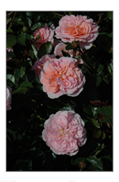
Apricot Drift Rose flowers

This shrub will require occasional maintenance and upkeep, and is best pruned in late winter once the threat of extreme cold has passed. It is a good choice for attracting bees to your yard. It has no significant negative characteristics.