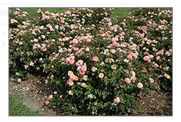
Apricot Drift Rose in bloom