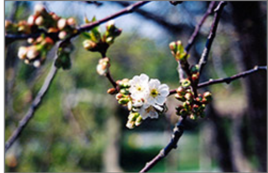
Montmorency Cherry flowers

Montmorency Cherry is clothed in stunning clusters of fragrant white flowers along the branches in mid spring before the leaves. It has dark green deciduous foliage. The pointy leaves turn an outstanding orange in the fall. The fruits are showy cherry red drupes carried in abundance in mid summer. The fruit can be messy if allowed to drop on the lawn or walkways, and may require occasional clean-up. The smooth dark red bark adds an interesting dimension to the landscape.