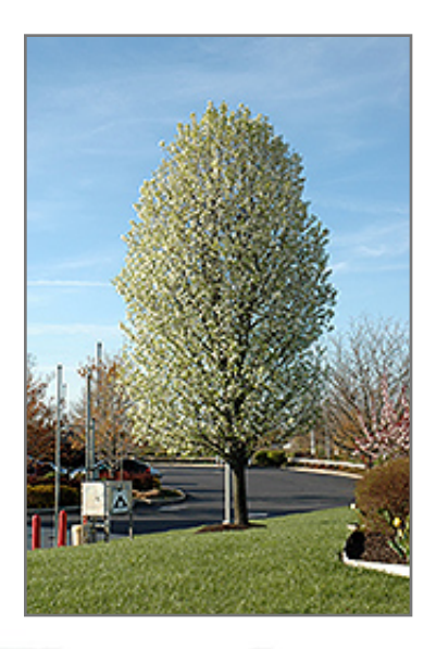
Chanticleer Ornamental Pear in bloom