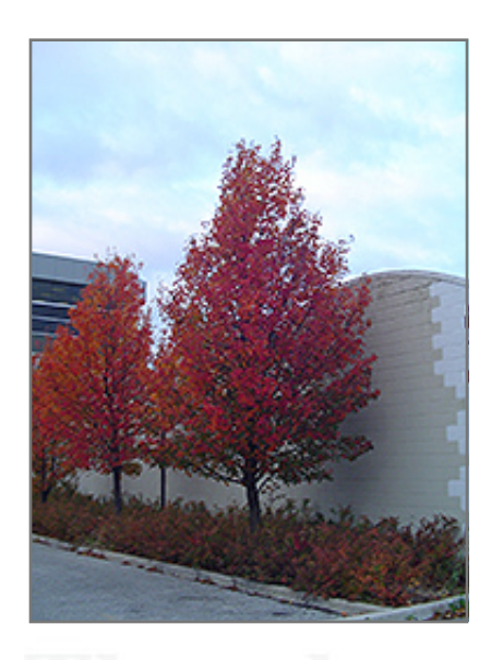
Chanticleer Ornamental Pear in fall

This tree should only be grown in full sunlight. It prefers to grow in average to moist conditions, and shouldn't be allowed to dry out. It is not particular as to soil type or pH. It is highly tolerant of urban pollution and will even thrive in inner city environments. This is a selected variety of a species not originally from North America.