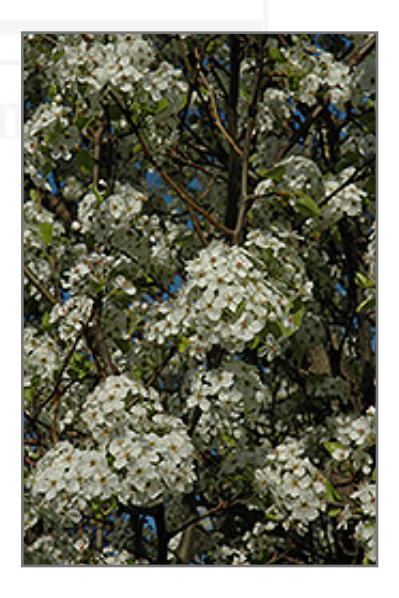
Chanticleer Ornamental Pear flowers