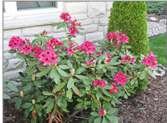
Nova Zembla Rhododendron in bloom