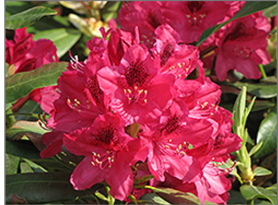
Nova Zembla Rhododendron flowers

Nova Zembla Rhododendron is recommended for the following landscape applications;