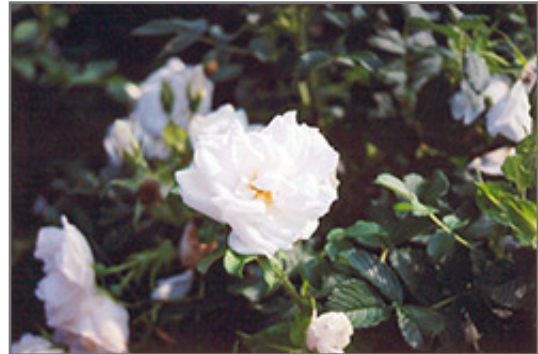
Blanc Double de Coubert Rose flowers

Blanc Double de Coubert Rose is recommended for the following landscape applications;