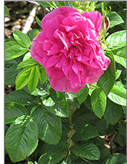
Hansa Rose flowers