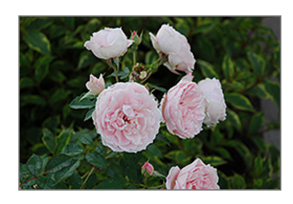
Morden Blush Rose flowers

Considered one of the most refined of shrub roses, this gem produces clusters of exquisite tea-like flowers that fade from the softest pink to a hint of ivory on a surprisingly tough plant with glossy green foliage; needs full sun and well-drained soil