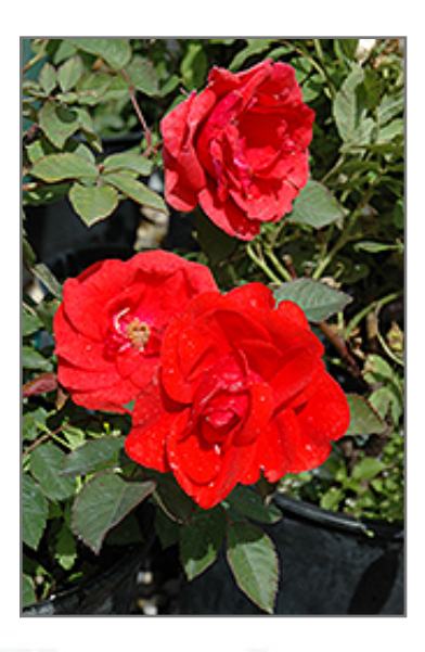
Morden Fireglow Rose flowers

This unique hardy shrub rose features double scarlet orange flowers from early summer through into fall on a vigorous, upright form; the flower color is truly distinctive, makes a fine color accent for the garden; needs full sun and well-drained soil