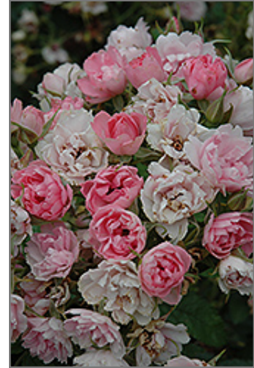
Pink Grootendorst Rose flowers

Pink Grootendorst Rose is recommended for the following landscape applications;