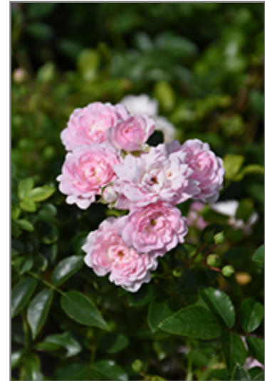
The Fairy Rose flowers

The Fairy Rose is recommended for the following landscape applications;