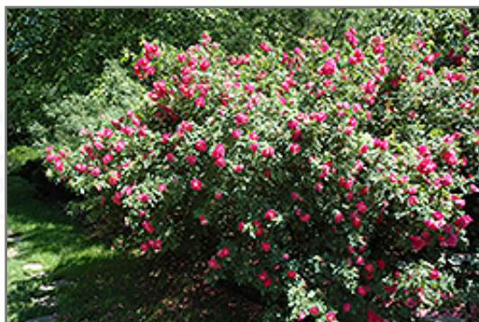
John Cabot Rose in bloom