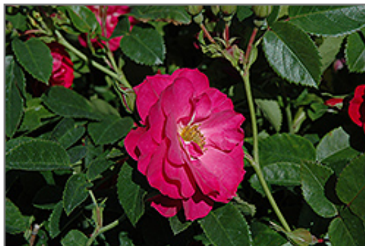
John Cabot Rose flowers

This is a high maintenance woody vine that will require regular care and upkeep, and is best pruned in late winter once the threat of extreme cold has passed. Gardeners should be aware of the following characteristic(s) that may warrant special consideration;