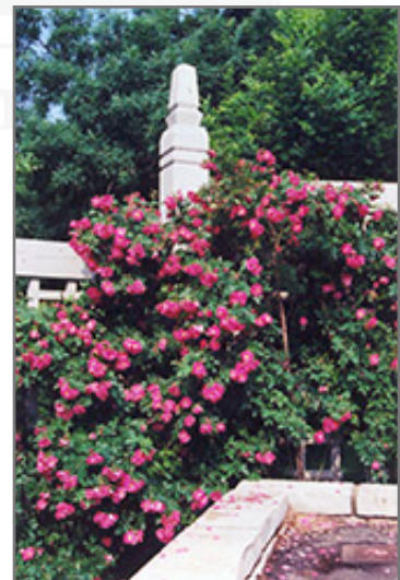
William Baffin Rose in bloom