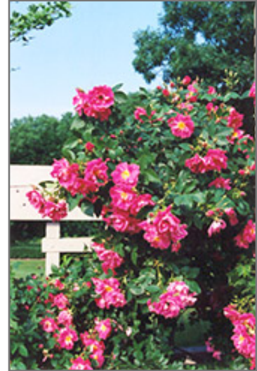
William Baffin Rose flowers