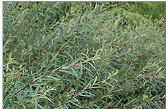
Dwarf Arctic Willow foliage