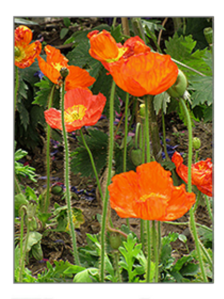
Iceland Poppy flowers

This fast growing variety has great flower power, producing volumes of beautiful blooms from orange to deep pink, also yellow and white; colors are available seperately; beautiful massed as a border planting