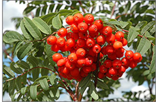
Cardinal Royal Mountain Ash fruit

Cardinal Royal Mountain Ash will grow to be about 30 feet tall at maturity, with a spread of 20 feet. It has a low canopy with a typical clearance of 4 feet from the ground, and should not be planted underneath power lines. It grows at a medium rate, and under ideal conditions can be expected to live for 50 years or more.