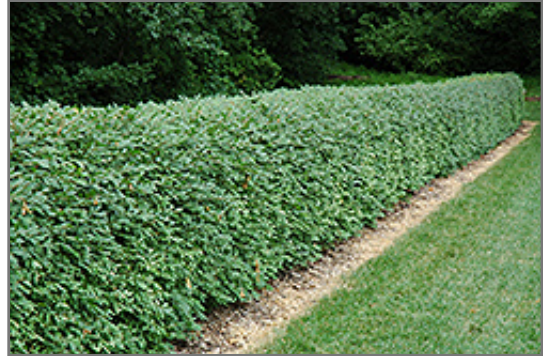
Winged Burning Bush

Winged Burning Bush will grow to be about 10 feet tall at maturity, with a spread of 10 feet. It tends to fill out right to the ground and therefore doesn't necessarily require facer plants in front, and is suitable for planting under power lines. It grows at a slow rate, and under ideal conditions can be expected to live for 50 years or more.