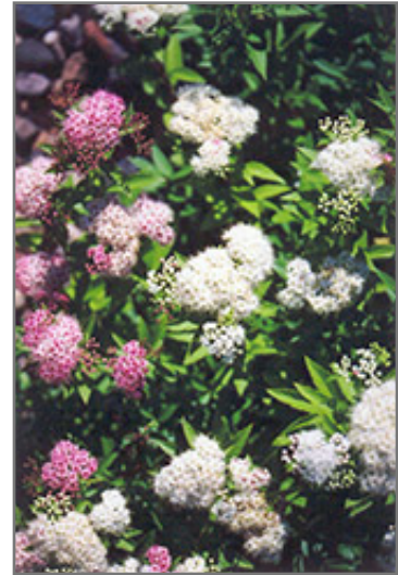
Shirobana Spirea flowers

This shrub will require occasional maintenance and upkeep, and is best pruned in late winter once the threat of extreme cold has passed. It is a good choice for attracting butterflies to your yard, but is not particularly attractive to deer who tend to leave it alone in favor of tastier treats. It has no significant negative characteristics.