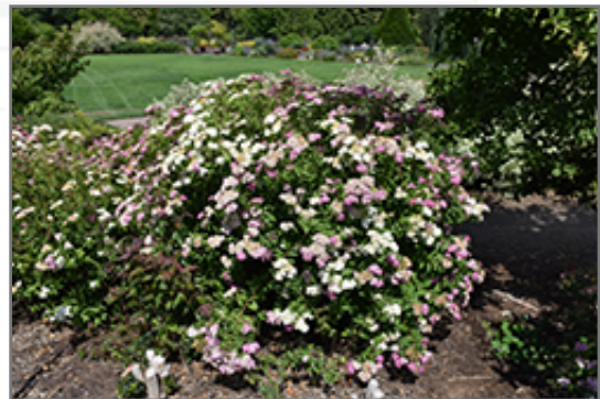
Shirobana Spirea in bloom