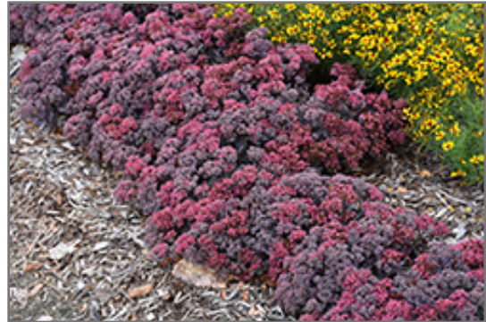
Dazzleberry Stonecrop in bloom