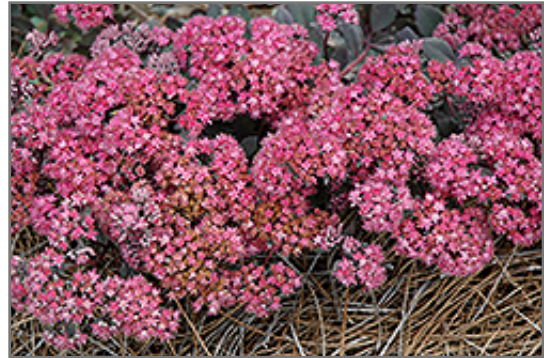
Dazzleberry Stonecrop flowers

Dazzleberry Stonecrop is a dense herbaceous perennial with an upright spreading habit of growth. Its medium texture blends into the garden, but can always be balanced by a couple of finer or coarser plants for an effective composition.