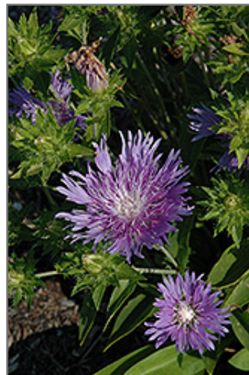
Peachie's Pick Aster flowers

Peachie's Pick Aster is recommended for the following landscape applications;