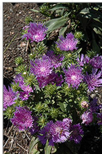
Peachie's Pick Aster flowers