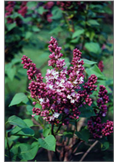
Belle de Nancy Lilac flowers