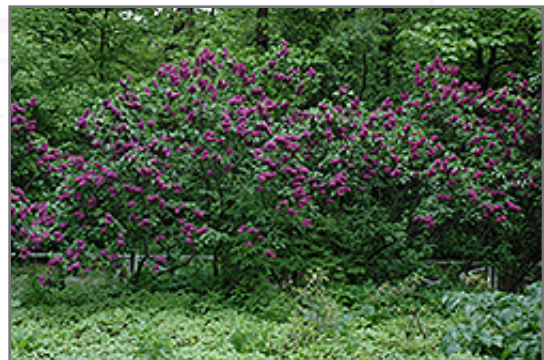
Charles Joly Lilac in bloom