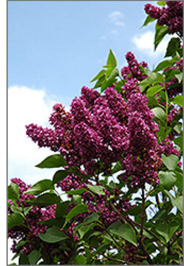
Charles Joly Lilac flowers

Charles Joly Lilac is a multi-stemmed deciduous shrub with an upright spreading habit of growth. Its relatively coarse texture can be used to stand it apart from other landscape plants with finer foliage.