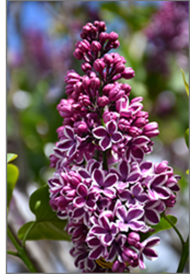
Sensation Lilac flowers

This is a high maintenance shrub that will require regular care and upkeep, and should only be pruned after flowering to avoid removing any of the current season's flowers. It is a good choice for attracting butterflies to your yard, but is not particularly attractive to deer who tend to leave it alone in favor of tastier treats. Gardeners should be aware of the following characteristic(s) that may warrant special consideration;