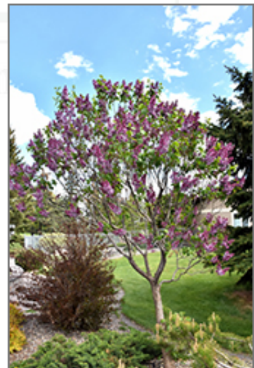
Sensation Lilac in bloom