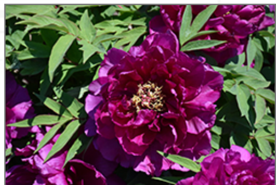
Shimadaijin Tree Peony flowers