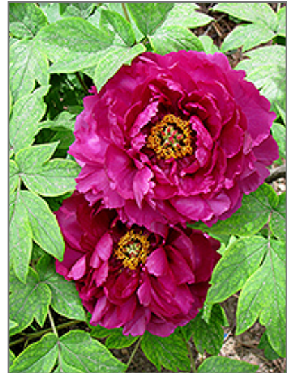
Shimadaijin Tree Peony flowers

Shimadaijin Tree Peony is a multi-stemmed deciduous shrub with an upright spreading habit of growth. Its relatively fine texture sets it apart from other landscape plants with less refined foliage.