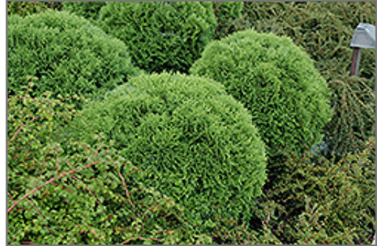
Little Giant Arborvitae