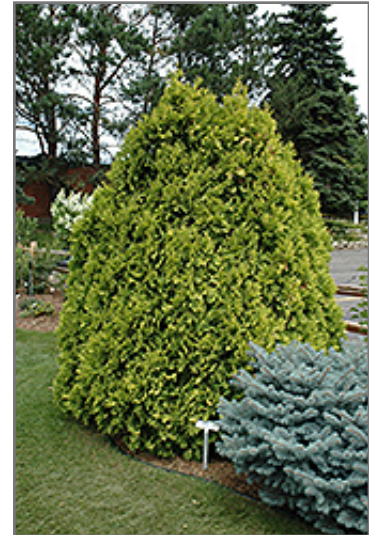
Sunkist Arborvitae

Sunkist Arborvitae is recommended for the following landscape applications;