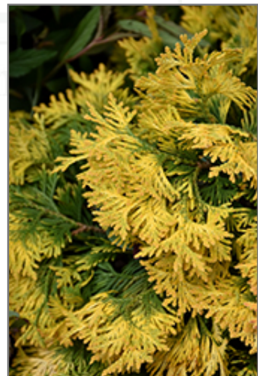
Sunkist Arborvitae foliage